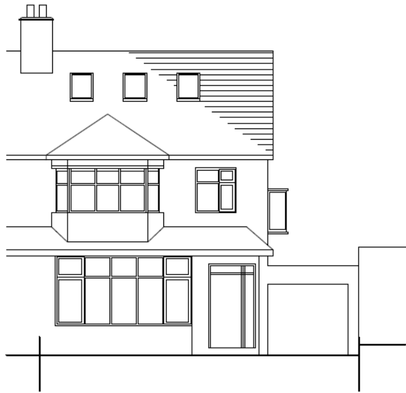
○ Front Elevation (W)