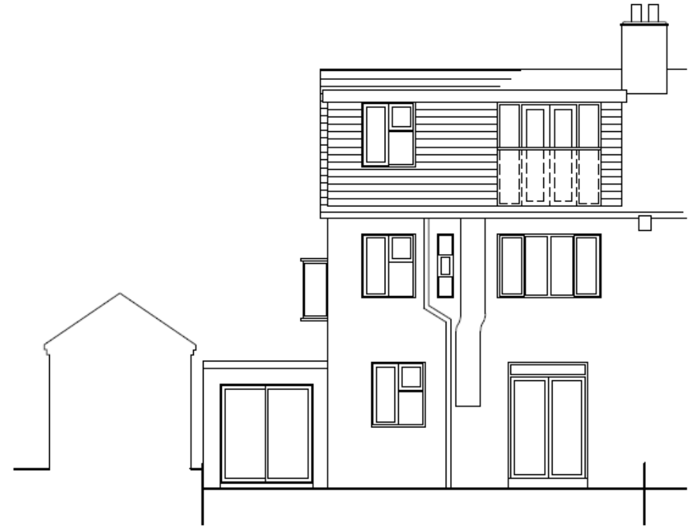
○ Rear Elevation (E)